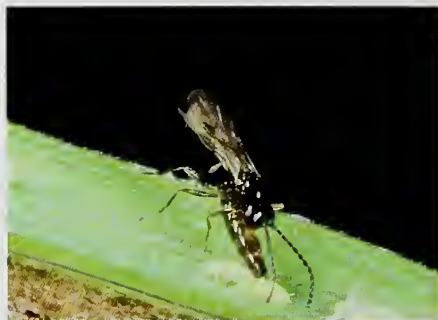
Parasitic wasp ( Aphidius sp.) ovipositing in a Russian wheat aphid.

in the West the seven-spotted lady beetle ( Coccinella septempunctata L.), a predator of several aphid pests. In Europe and Asia, this lady beetle is a common predator of the Russian wheat